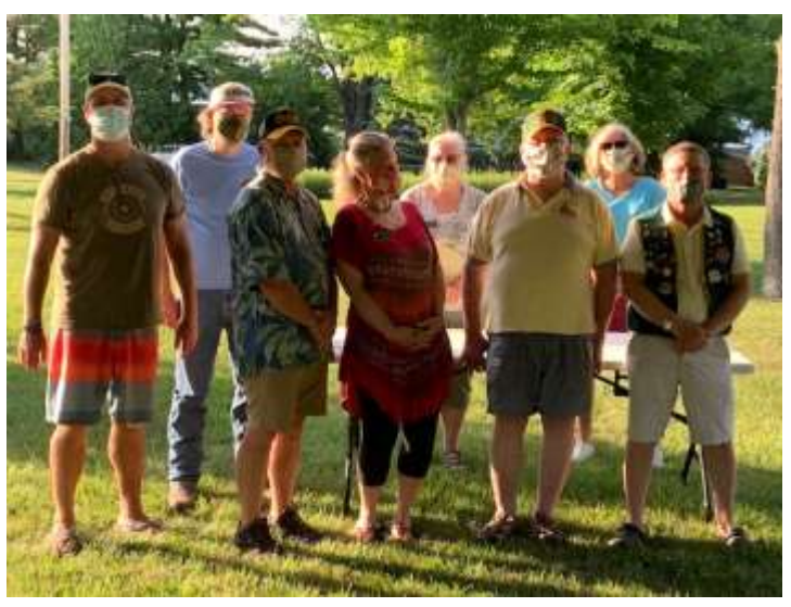
Meals delivered to Vermont Foodbank (Barre and Rutland):