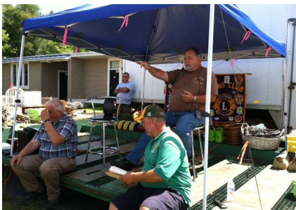
Colchester Lions Auction