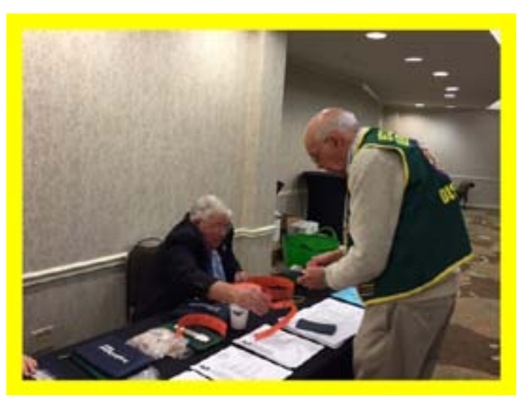
Cabinet Meeting Ticket Sales Going Strong!