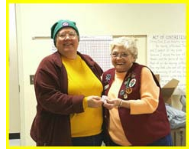
Zone Chair Visits Williston!