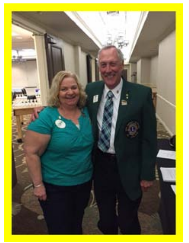
Cabinet Meeting Smiles!