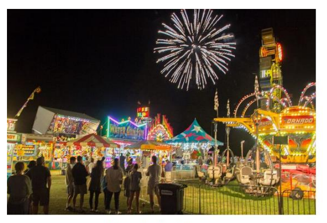
A nice night at the Norwich Fair

If you are interested in buying one please see any Norwich Lions Club member that you may know or come and see me and I can sell you one. You can make a check out to the Norwich Lion's Club or pay cash (sorry no credit cards). If you need one you can call me at 802-829-9133 and leave a message.