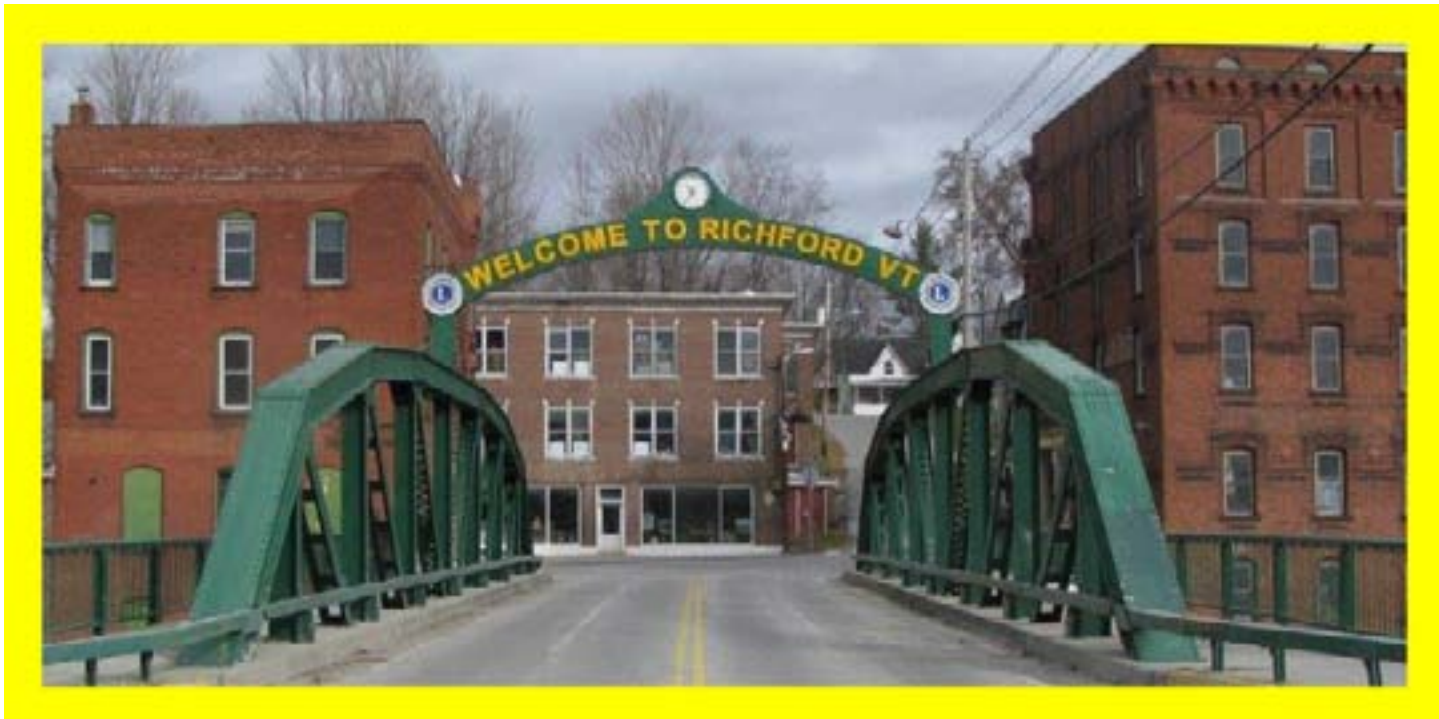
"Welcome To Richford" flanked by Lions!