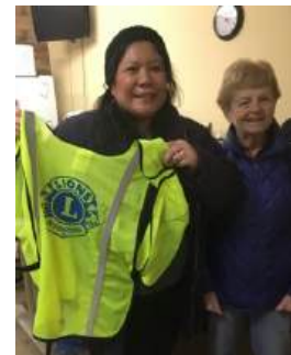
Lions Nini and Linda