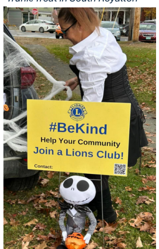
Trunk/Treat in South Royalton