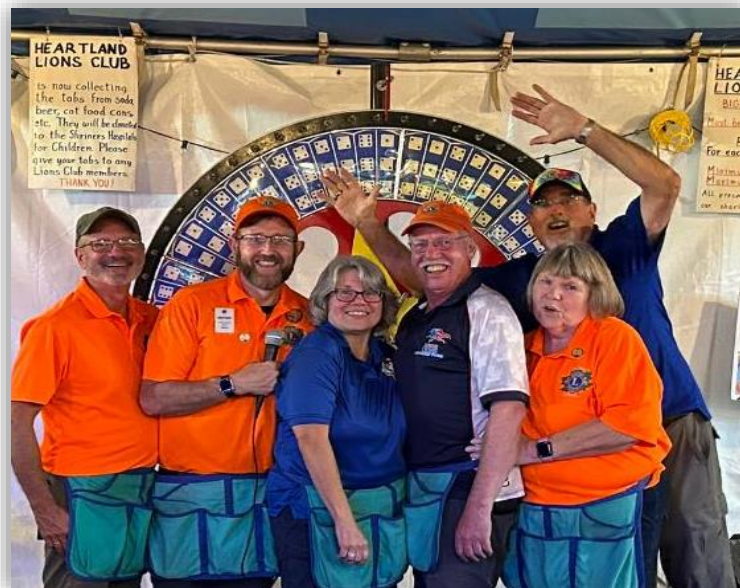
Saturday Night Crew at Tunbridge Fair