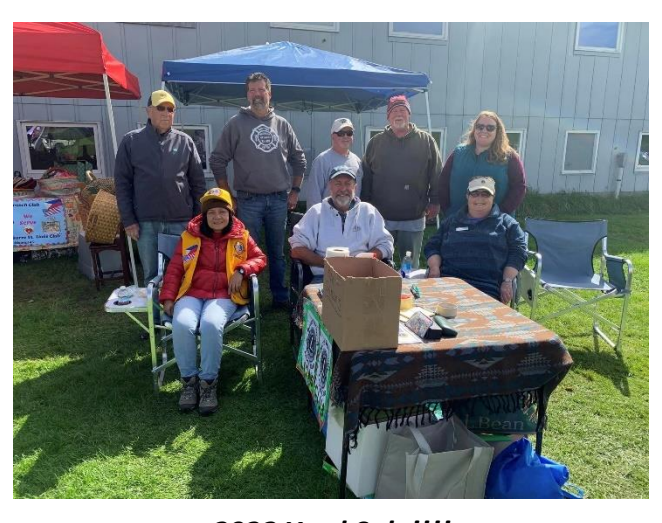
2022 Yard Sale!!!!