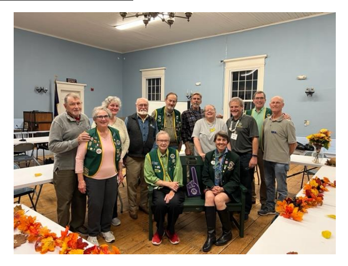
Also hosted the first Zone 1-B meeting of the 2022 – 2023 Lions year: