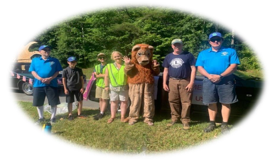
Colchester 4th of July!!!!

Braintree, Brookfield and Randolph Area Branch Club - they recently took part in the Randolph July 4 parade