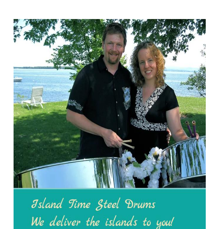
5:30pm-6:30pm – Saturday Night

Reservations due no later than April 13, 2022.