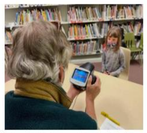
Award insignia (left), Welch Allyn Spot® Vision Screener in action (right)

The Project See Clearly '21 "Top Ten" Awards and Recognition Program is an initiative of the Lions KidSight USA Foundation to encourage Lions Clubs to resume their vision screening of school children in the last quarter of 2021, with a goal of screening one million children. In a typical non-COVID year, US Lions Clubs screen two million children.