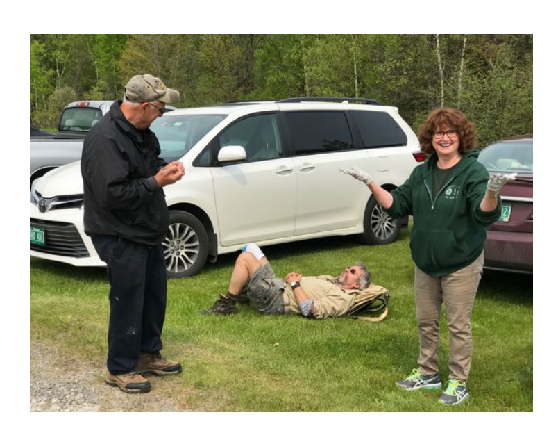
Must be they overworked him