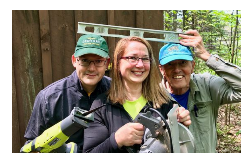
These Lions are levelheaded "Really they are"

Norwich Lions arrived at the Camp around 9:30 am and we were immediately put to work. We spent the morning pruning and lopping trees and picking up and piling branches and limbs that had accumulated around cabins and tent platforms.