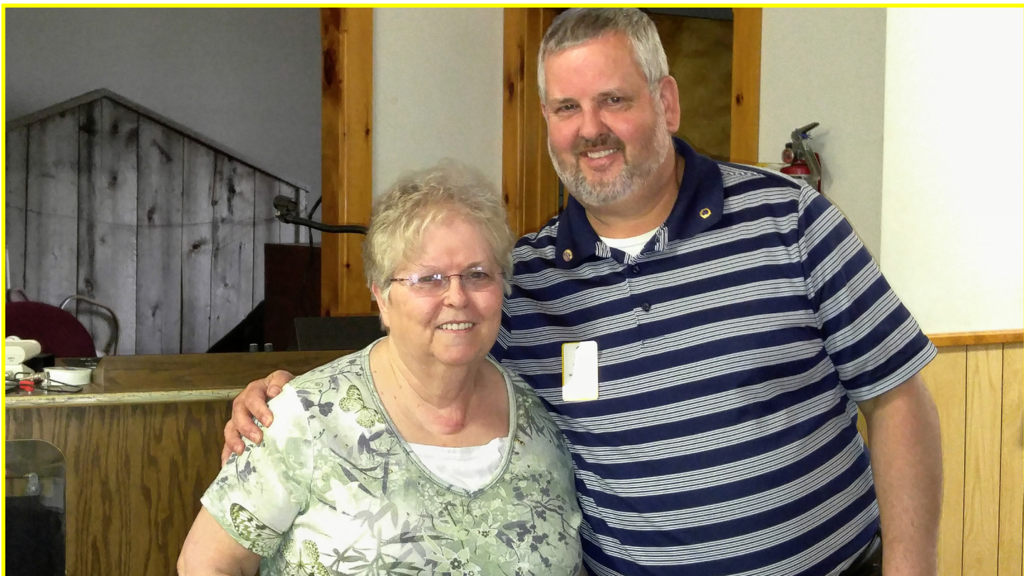
Thursday May 19th, Troy and Area Lions Bingo.