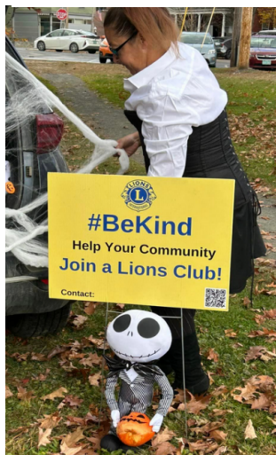
Trunk/Treat in South Royalton